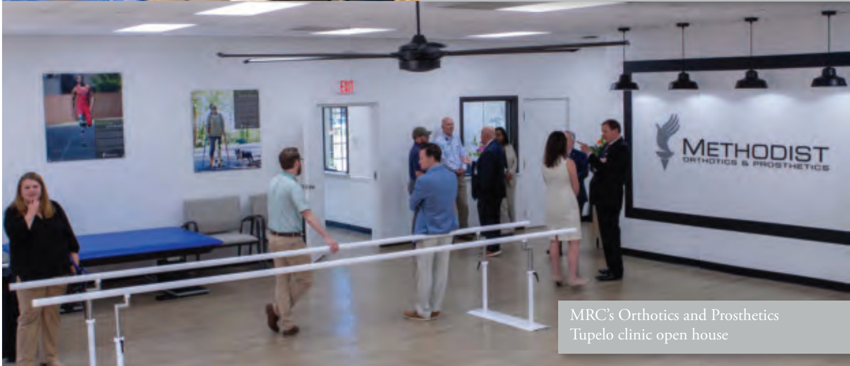
MRC's Orthotics and Prosthetics Tupelo clinic open house