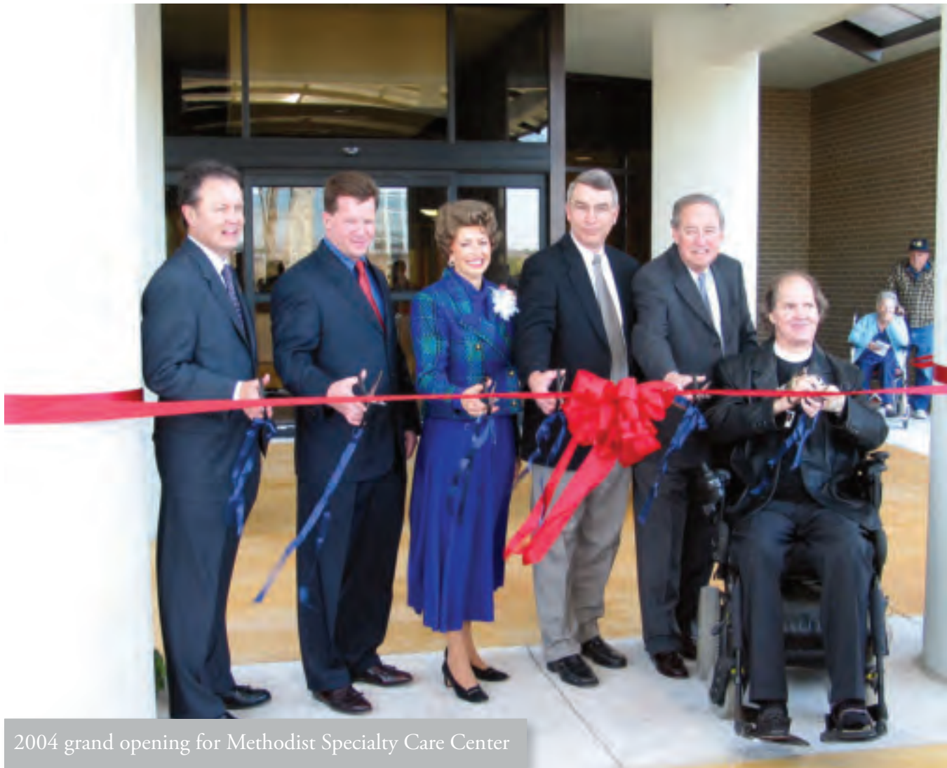
2004 grand opening for Methodist Specialty Care Center