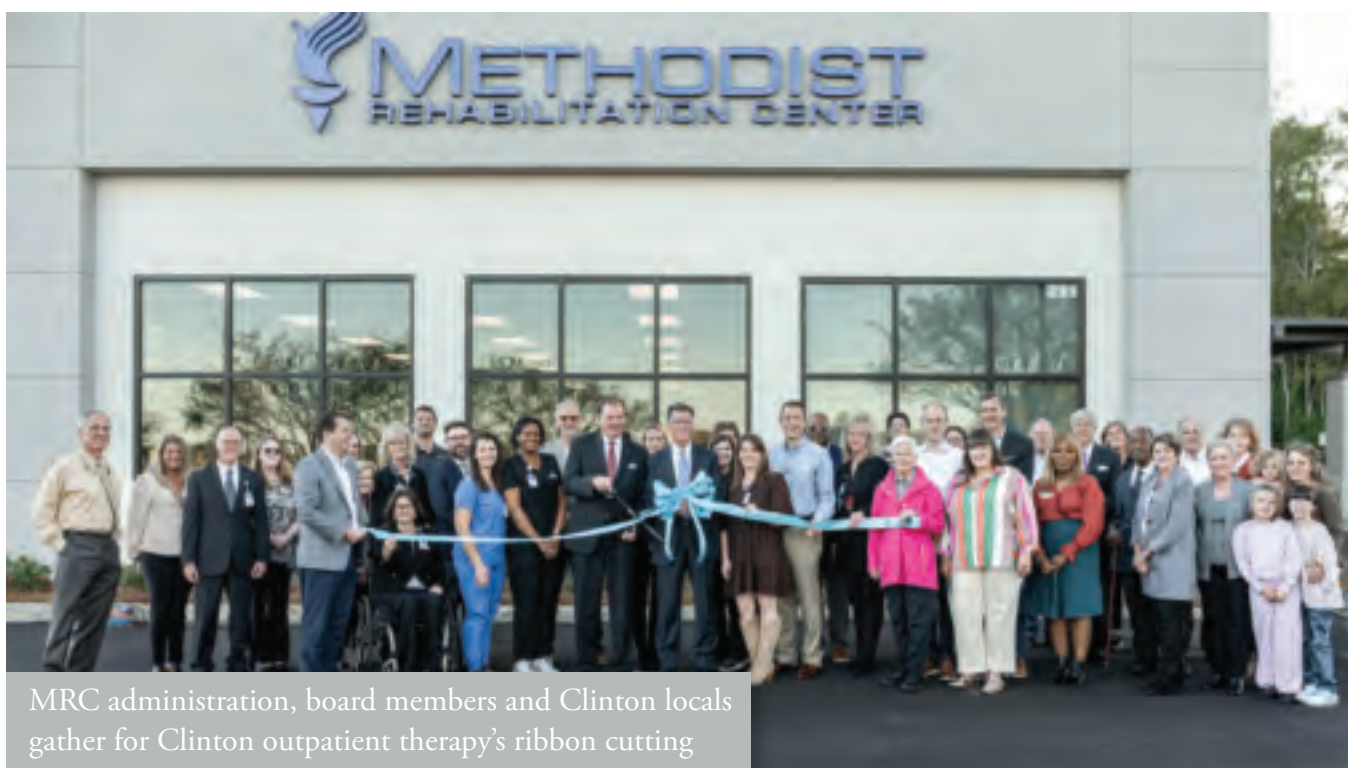
MRC administration, board members and Clinton locals gather for Clinton outpatient therapy's ribbon cutting