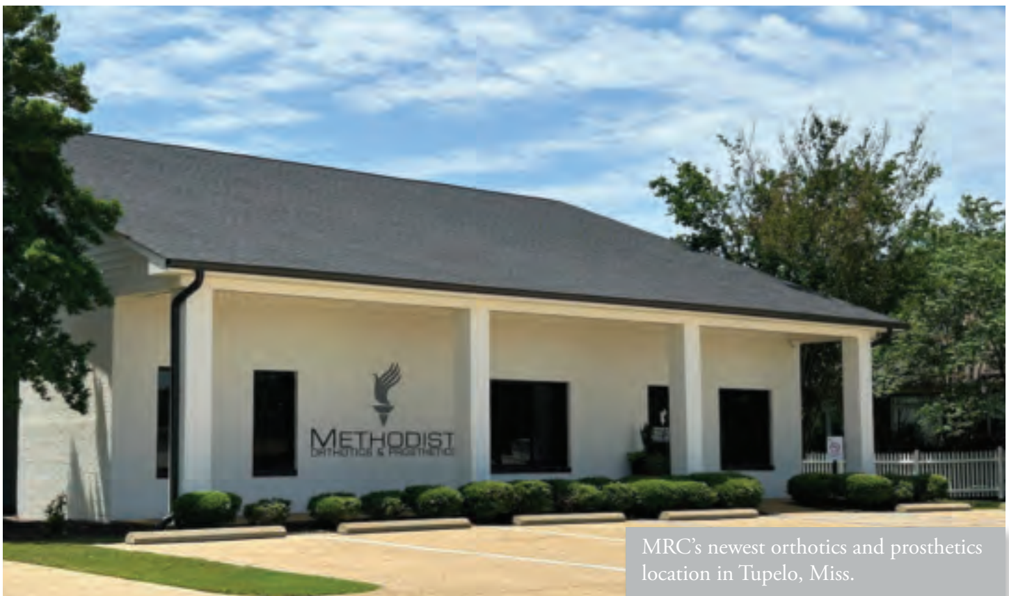
MRC's newest orthotics and prosthetics location in Tupelo, Miss.